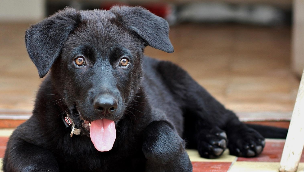
“Chaos” Our First K-9 Officer

Visit 4sProject.org or call us at (833) 776-8363 .